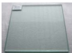
Clear float glass